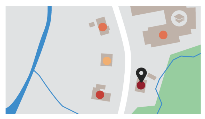
Flood Factor: This tool shows a dot representing flood risk for each property ranging from minimal (green) to extreme (dark red).